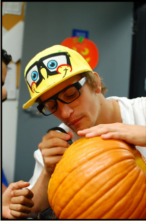
CARVING PUMPKINS CAN BE SERIOUS BUSINESS ...