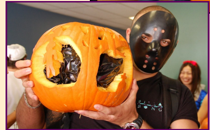
... BUT IT CAN ALSO BE SCARY!