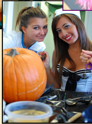
... AND FUN ...